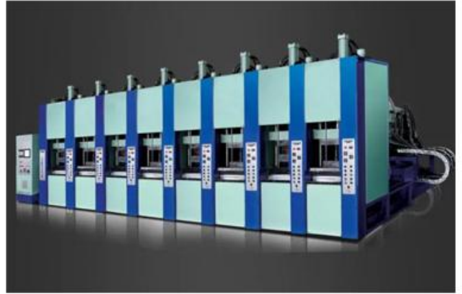
EVA injection machine