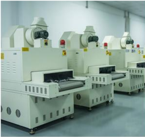
UV light machine