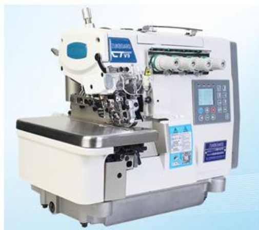
automatic welting machine