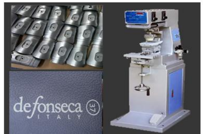
Pad Printing Machine