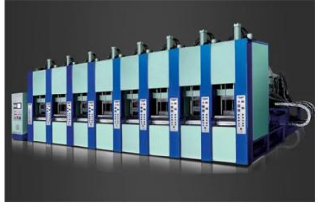
EVA injection machine